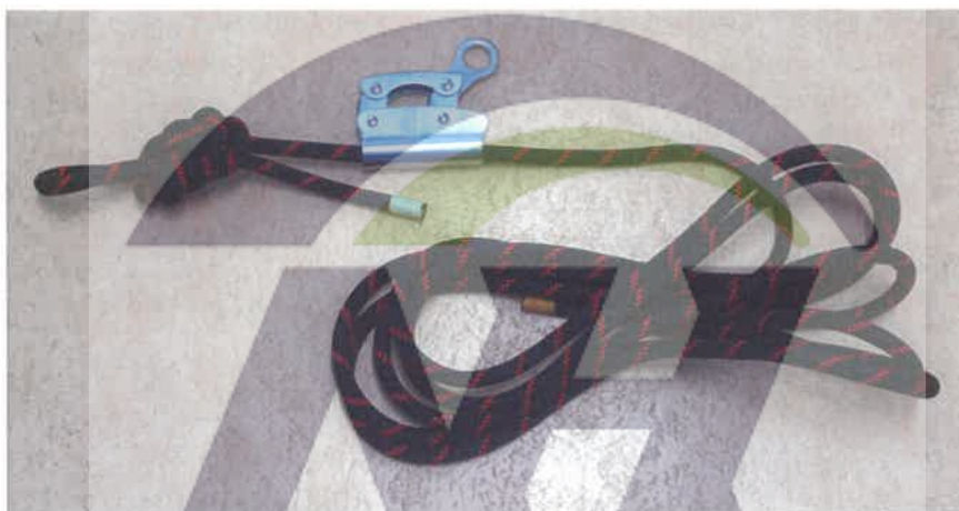
Steel Rope Grab (Closed type), type YIG004 - Low stretch kernmantel rope of diameter of 12 mm – PA/PES