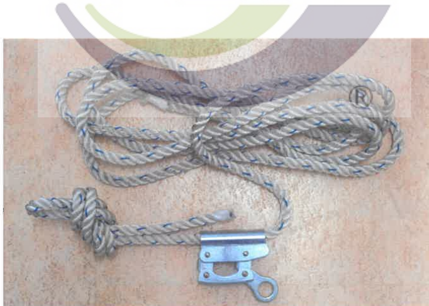
Steel Rope Grab (Closed type), type YIG004 - Three strand twisted rope of diameter of 16 mm – PA