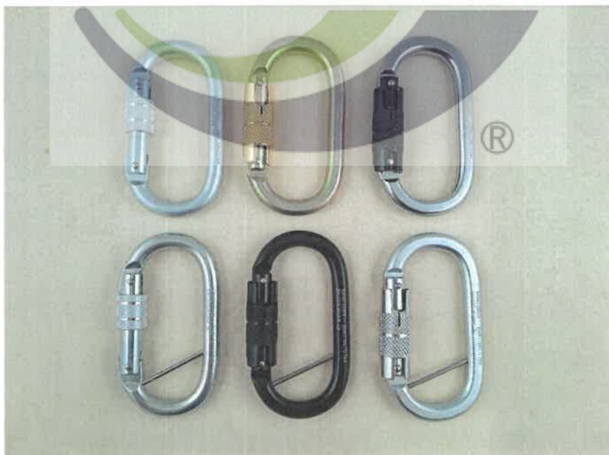
Steel Rebar Carabiner, type YIC001S YIC001D YIC001T, YIC001S-CP (Captive bar), YIC001D-CP (Captive bar), YIC001T-CP (Captive bar)