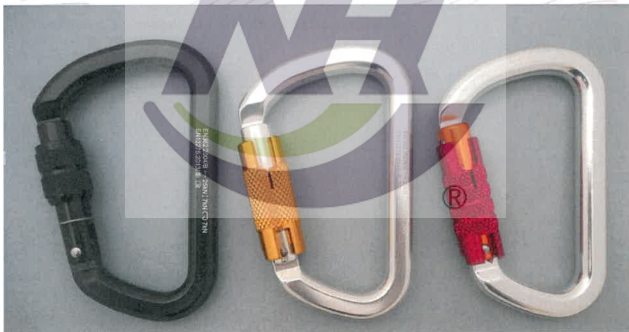
Aluminum Carabiner, type YAC012S, YAC012D, YAC012T