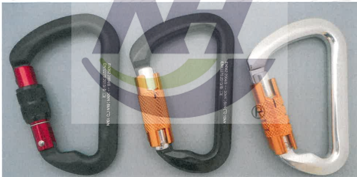
Aluminum Carabiner, type YAC015S, YAC015D, YAC015T