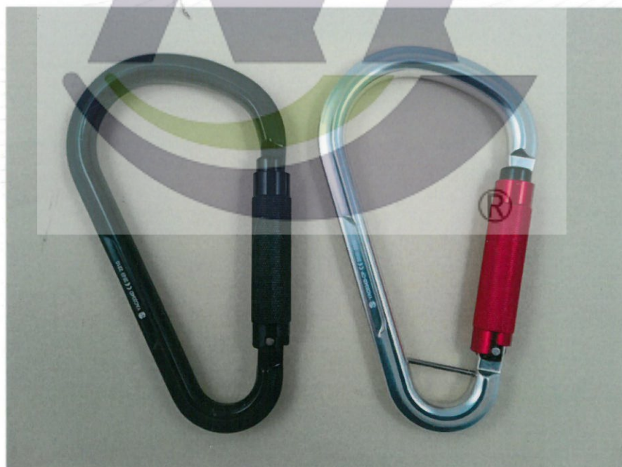
Aluminum Carabiner, type YAC034D YAC034D-CP (Captive bar)